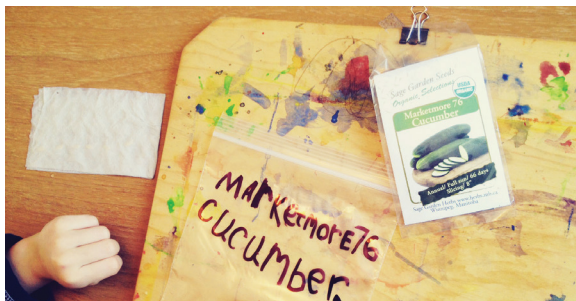
Label the bag with seed type.