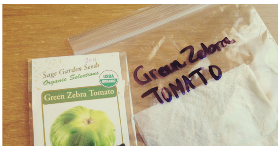
Store - warm + dark for 3 days.