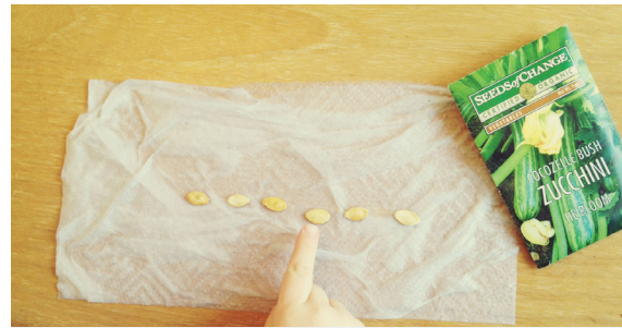
Place and count seeds.