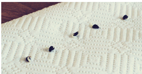
Moldy seed? Toss + new towel.