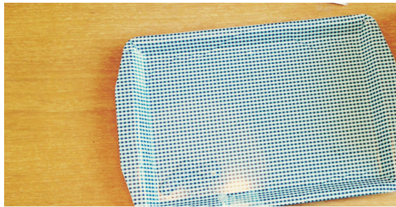
Dip paper towel in tray of water.