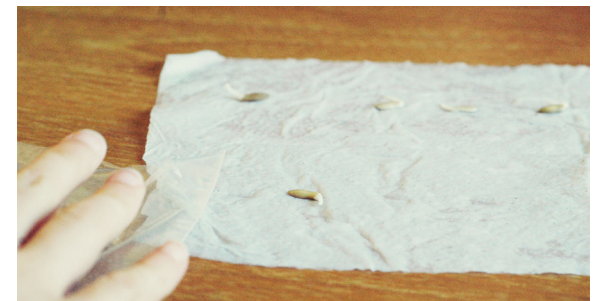
Check for germination. Record.