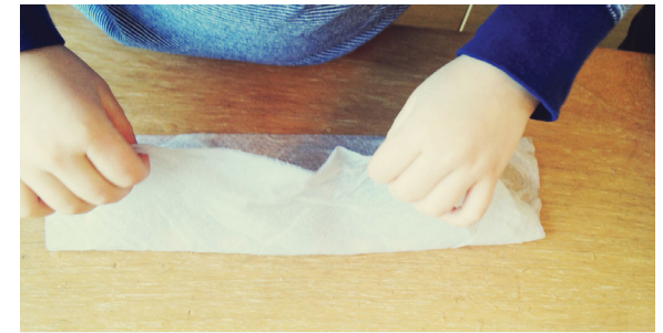
Fold the towel over, and again.